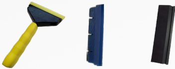
YELSQUEEG BLUESQUEEG BLAKSQUEEG

BLAKSQUEEG (soft) black squeegee for the application of BodyFence on concave highly curved surfaces. Width: 23,5 cm - 9"¼