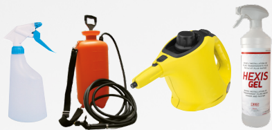
PULVERISAT PULVITRE STEAMERSC1 HEXISGEL

The new HEXIS Gel has been specially developed for the application of BodyFence. It allows to significantly reduce the application time.